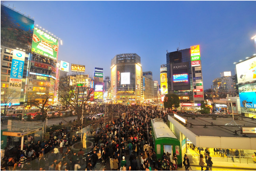
Outside Shibuya station, looking towards the pedestrian scramble

One of Tokyo's most lively and colorful neighborhoods, Shibuya is most famous as a youth fashion hotspot and the busiest road crossing you will ever see. Originally the site of a castle belonging to the Shibuya clan, since the introduction of the Yamanote Line it has become one of the main clubbing, shopping and entertainment areas in Tokyo.